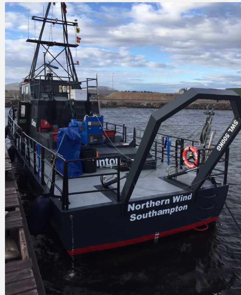
Updating Nautical Charts